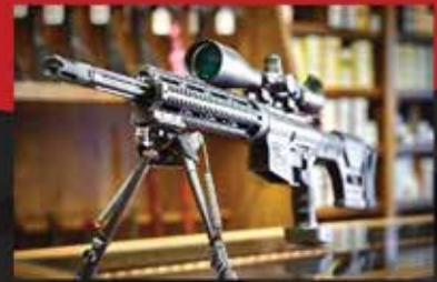
Large Firearm Selection