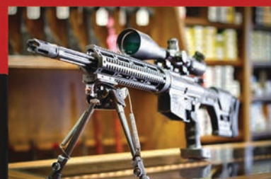
Large Firearm Selection

Buy | Sell | Trade | Guns | Tackle 940-228-2791 | 4300 Kemp Blvd | Wichita Falls, TX marksmenfirearms.com